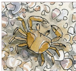
African matchbox crab