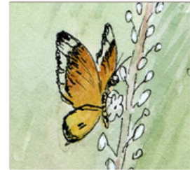
Plain Tiger Butterfly