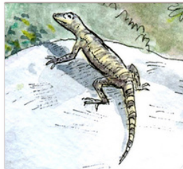
Roughtail Rock Agama