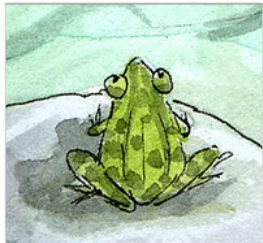
Levant water frog